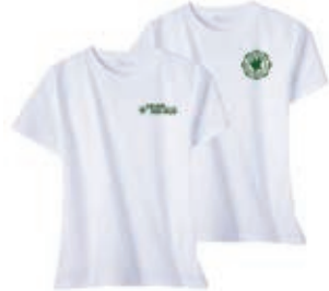
Fitted Tee and Fitted Tank Top Size Chart